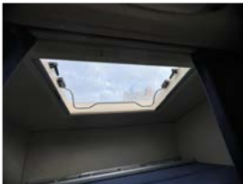
+3 more photo(s) available