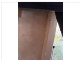
+1 more photo(s) available